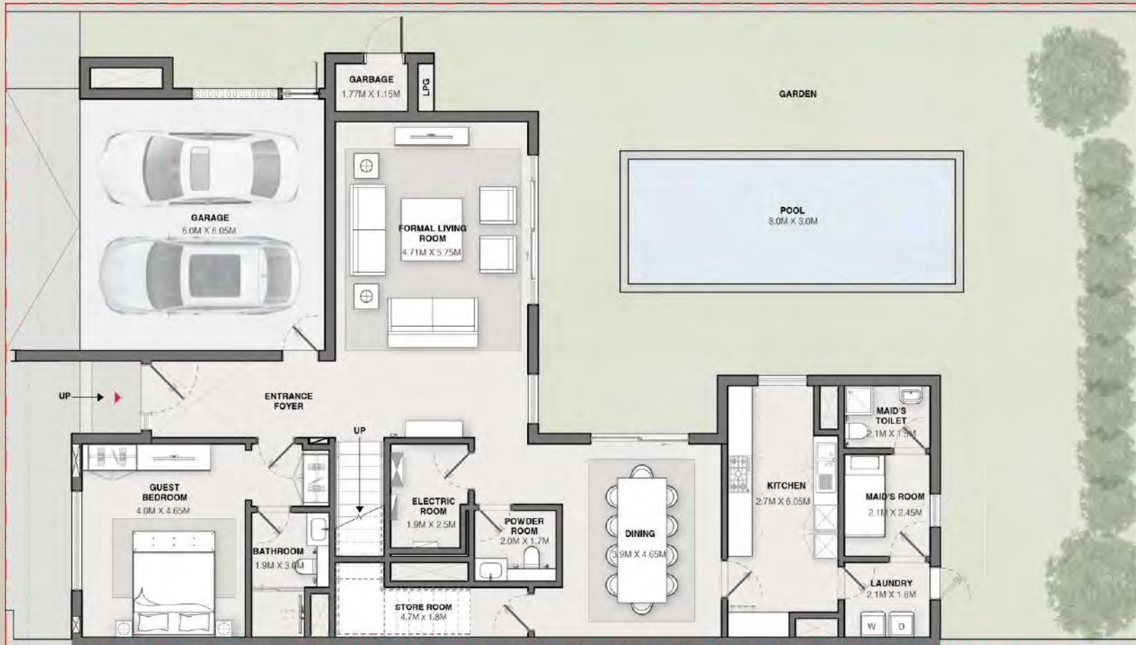
4 A GROUND FLOOR