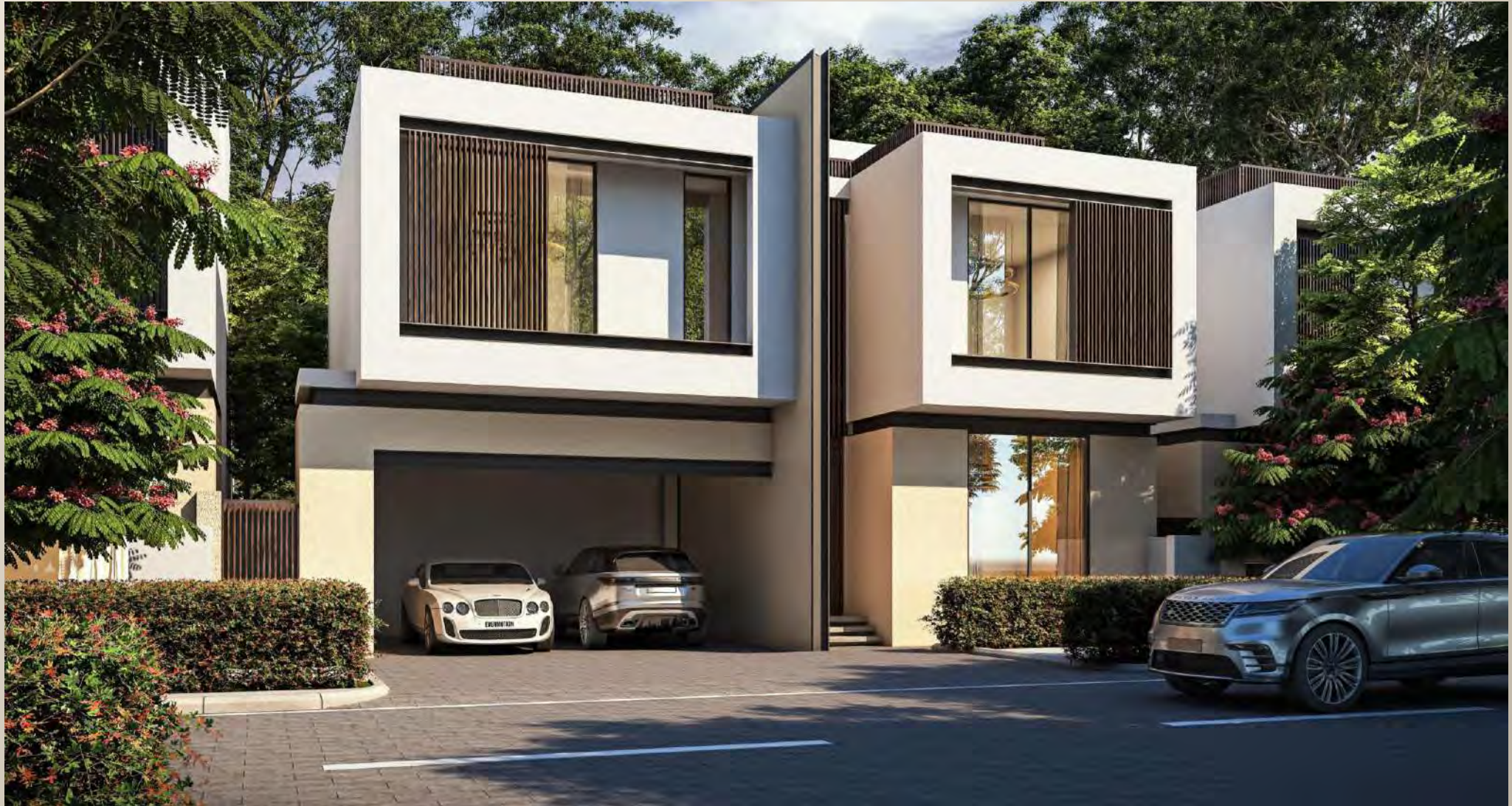
4 BEDROOM TYPE A