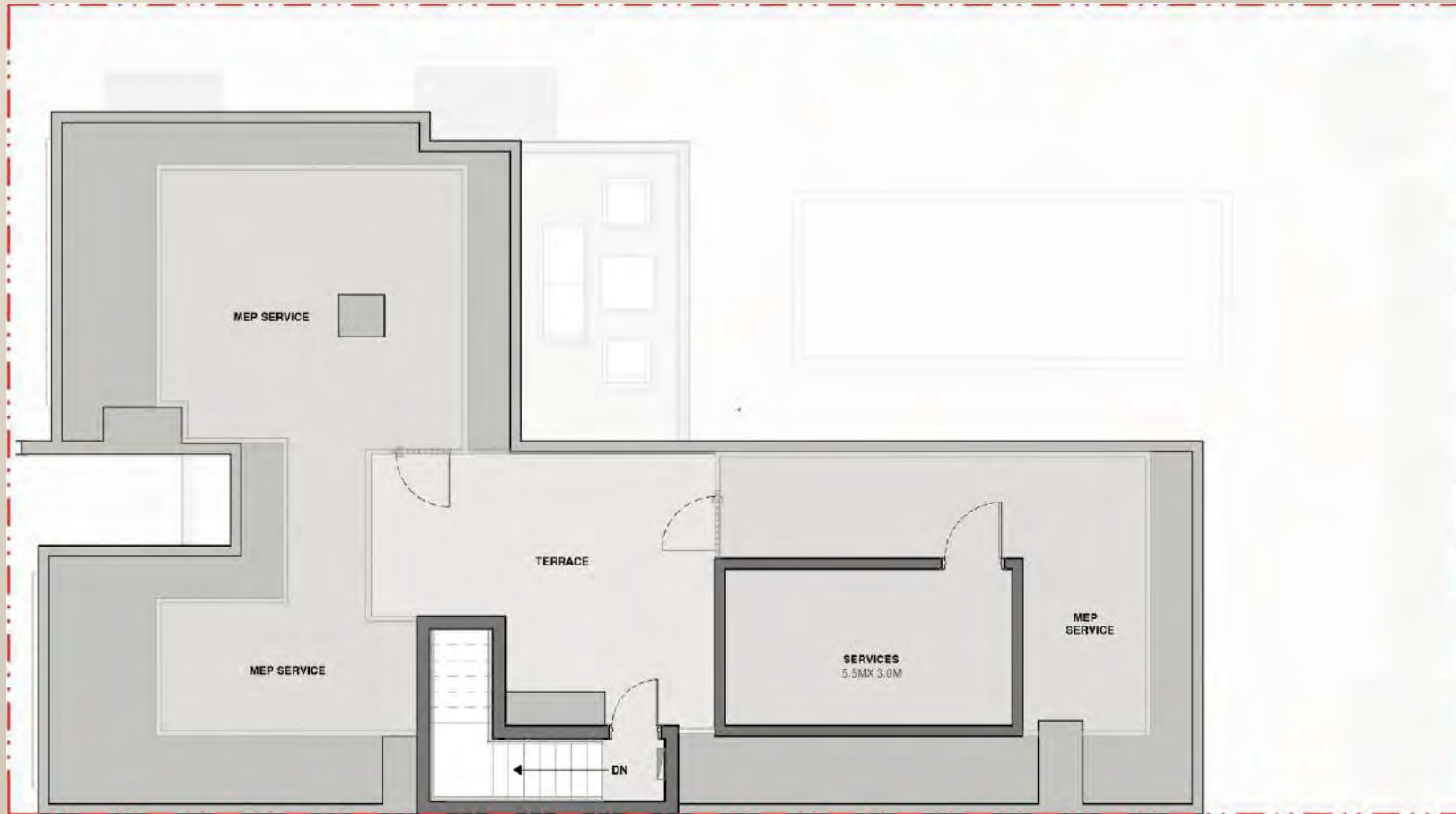
4 A TERRACE